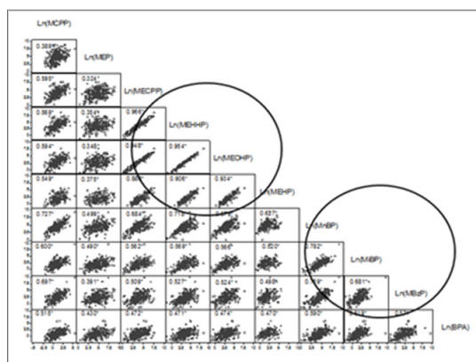
Figure 1 Correlations between phthalate metabolites and bisphenol A in urine from pregnant Mexican women (n =290) on a logarithmic scale. Values correspond to Pearson correlations.